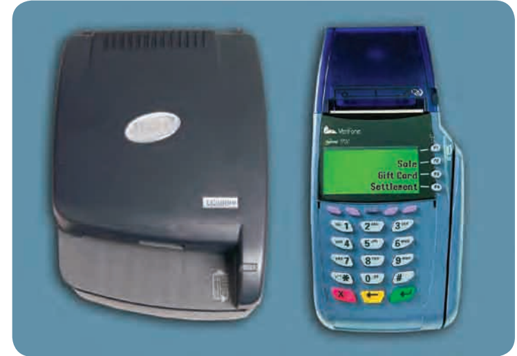
Omni 3730le/Vx510le and the RDM EC6000i Imager